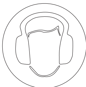
WEAR EAR PROTECTORS

Cutting, alteration, and installation of Watson & Gabb panels should be carried out only by competent professionals with suitable equipment and PPE.